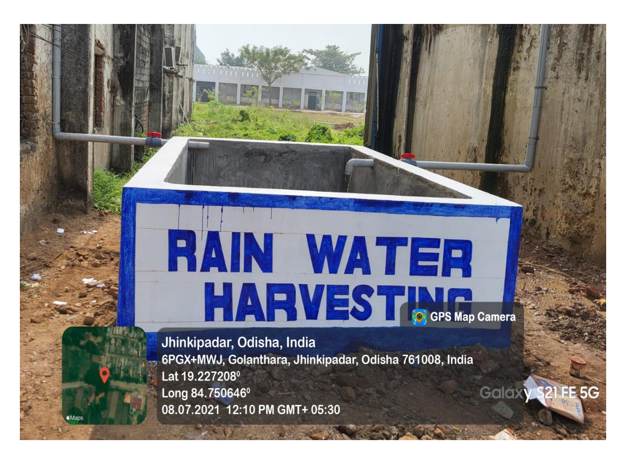
Rain water harvesting facility in institute