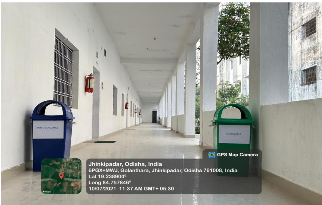
Management of the various types of degradable and non-degradable waste by use of dustbins