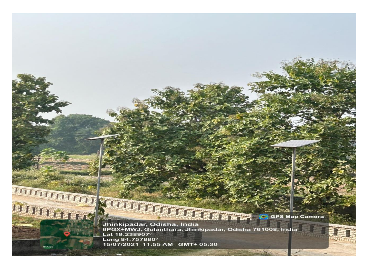
Solar Street Light