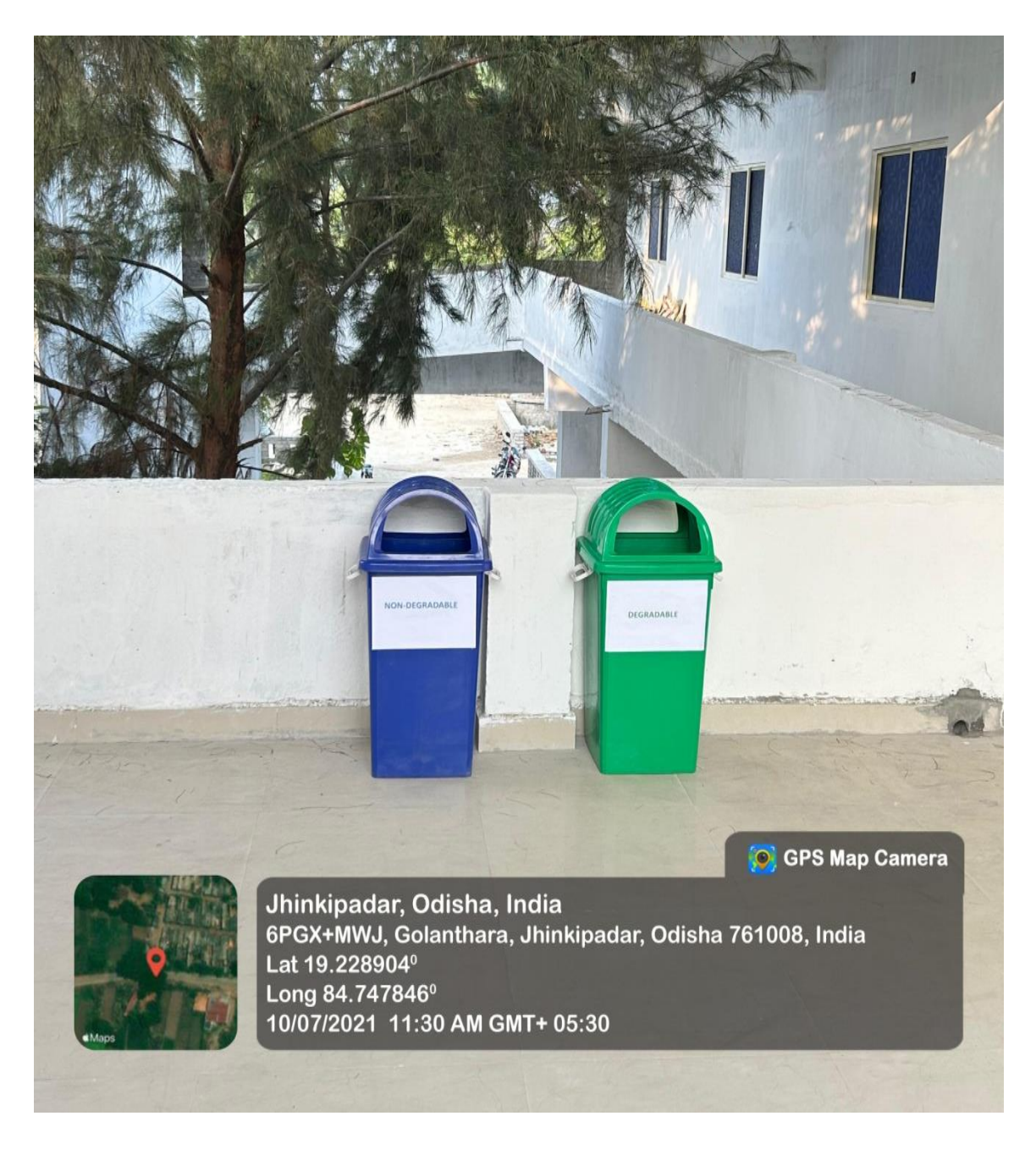
Management of the various types of degradable and non-degradable waste by use of dustbins in different location of institute