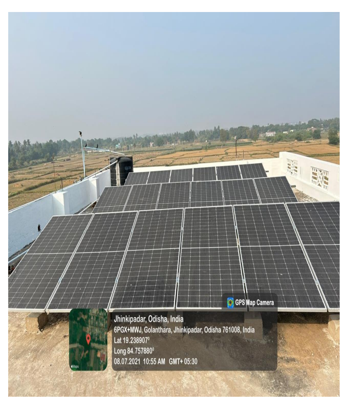
Alternate sources of energy (Solar PV cell)