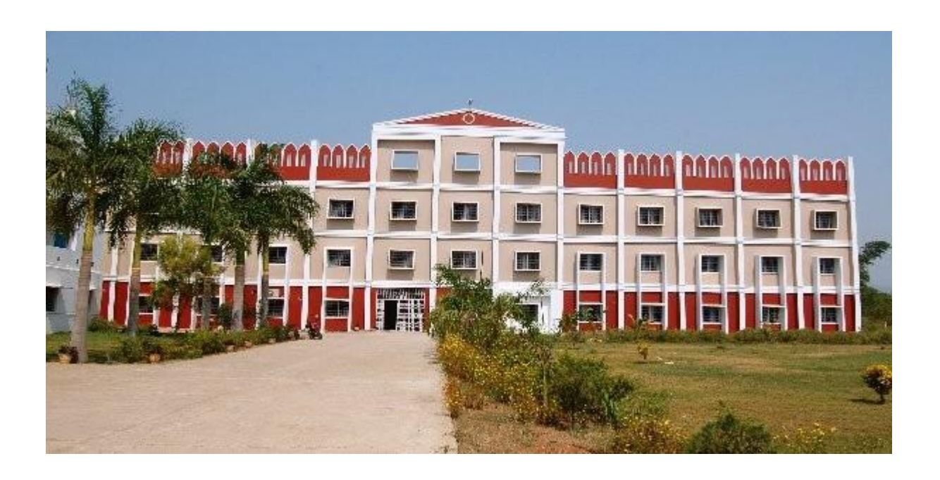
Submitted to NAAC