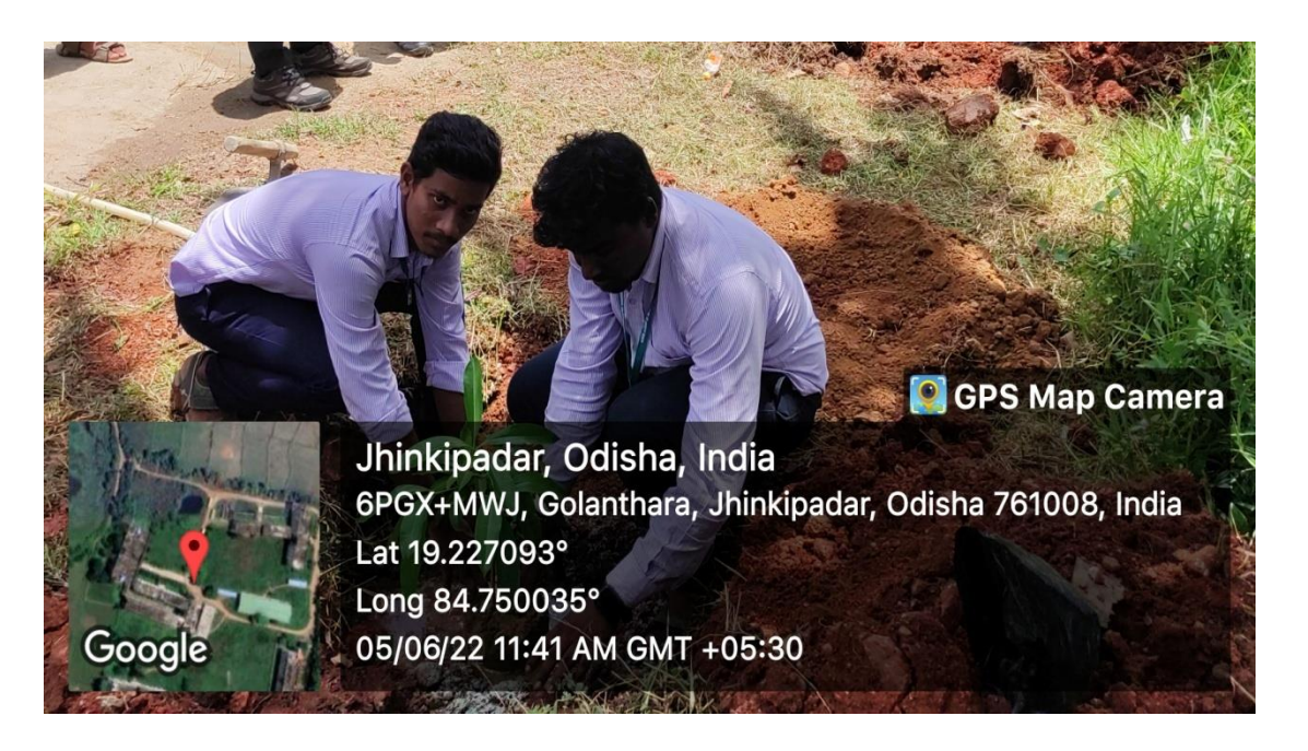
Plantation Program on institute Campus