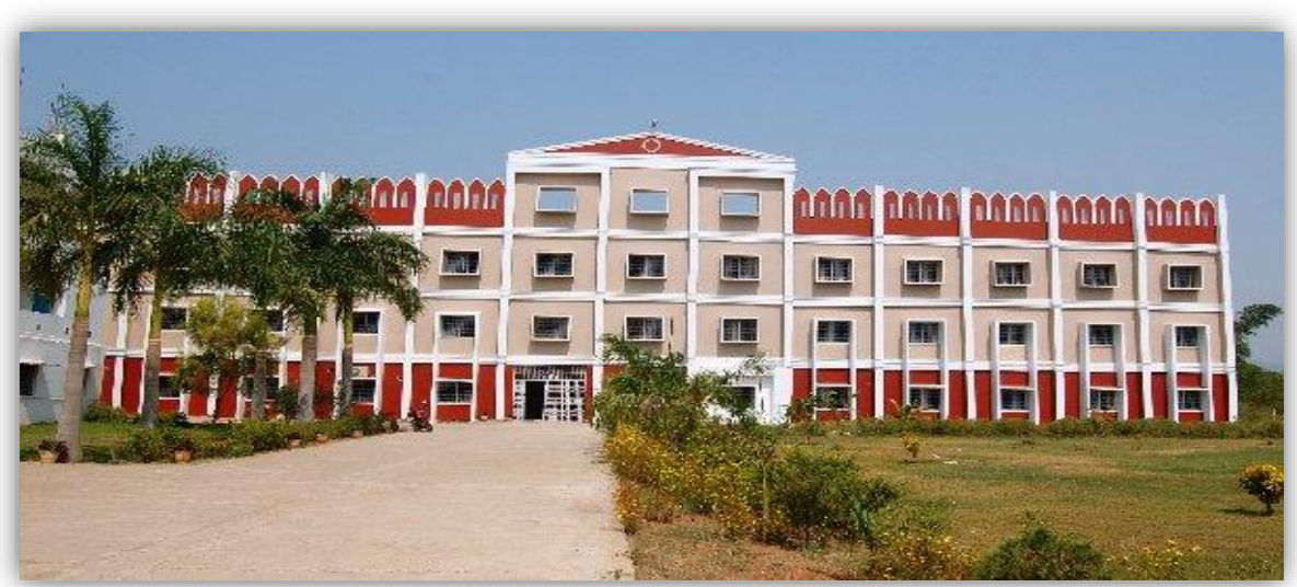
Submitted to NAAC By Gandhi Academy of Technology and Engineering Golanthara, Berhampur