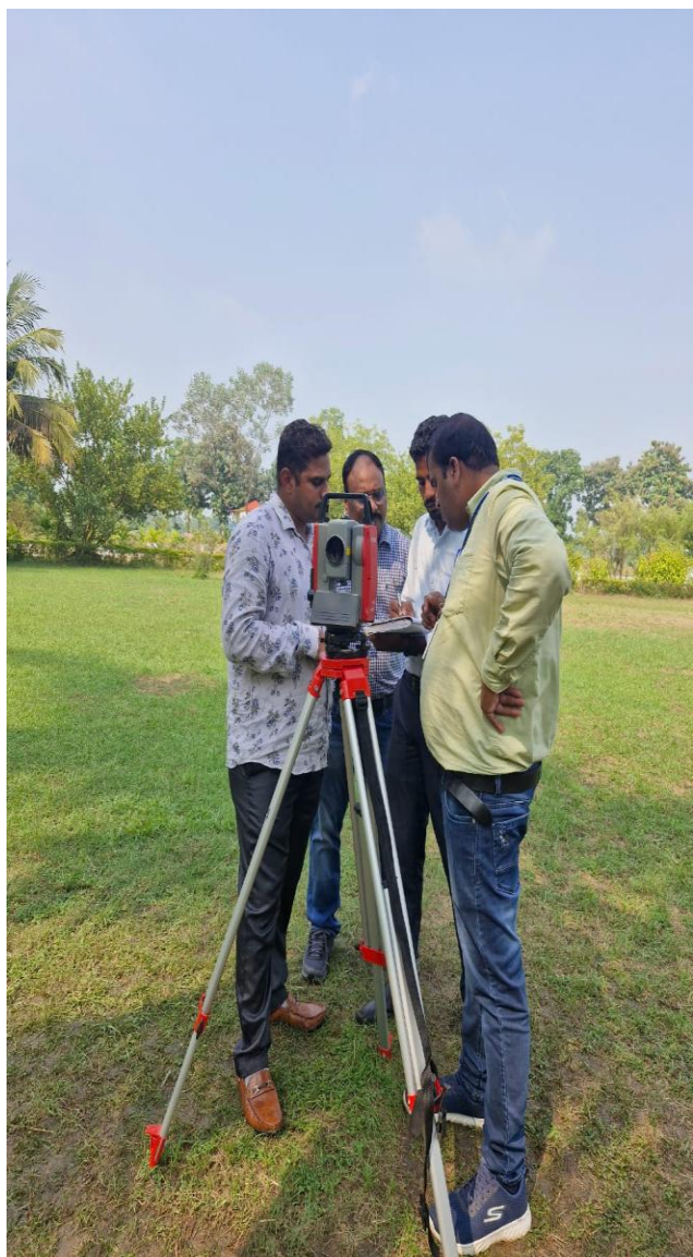
2.7 Civil -Engineering Lab