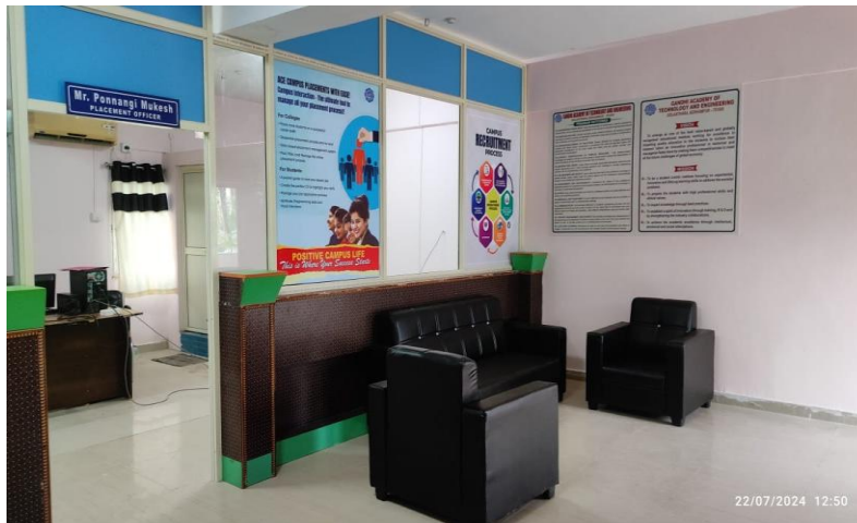
1.2. Training and Placement Room