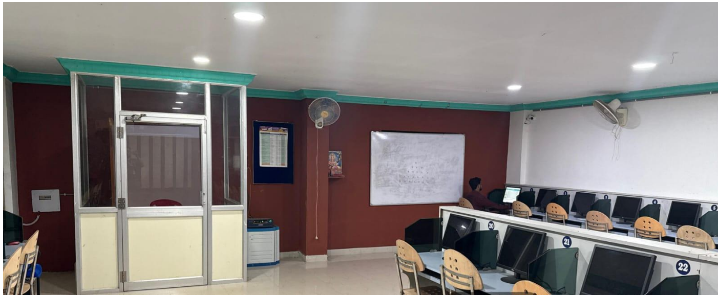
2.2 DBMS Labs