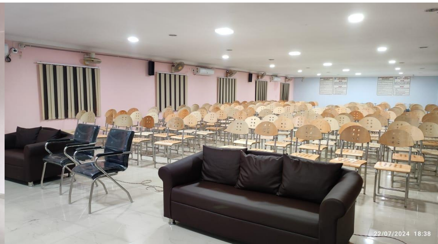
1.3 Conference Hall