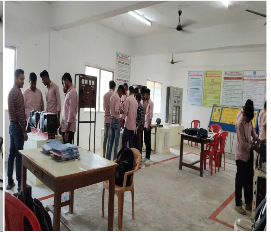
2.8 Electrical Engineering Lab