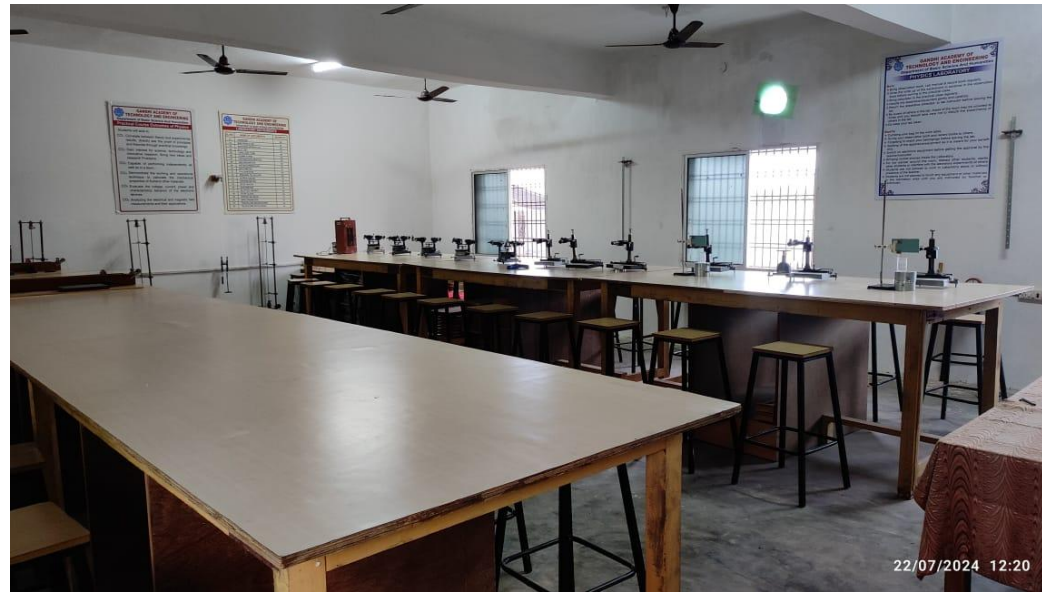
2.4 Physics Lab (BSH)