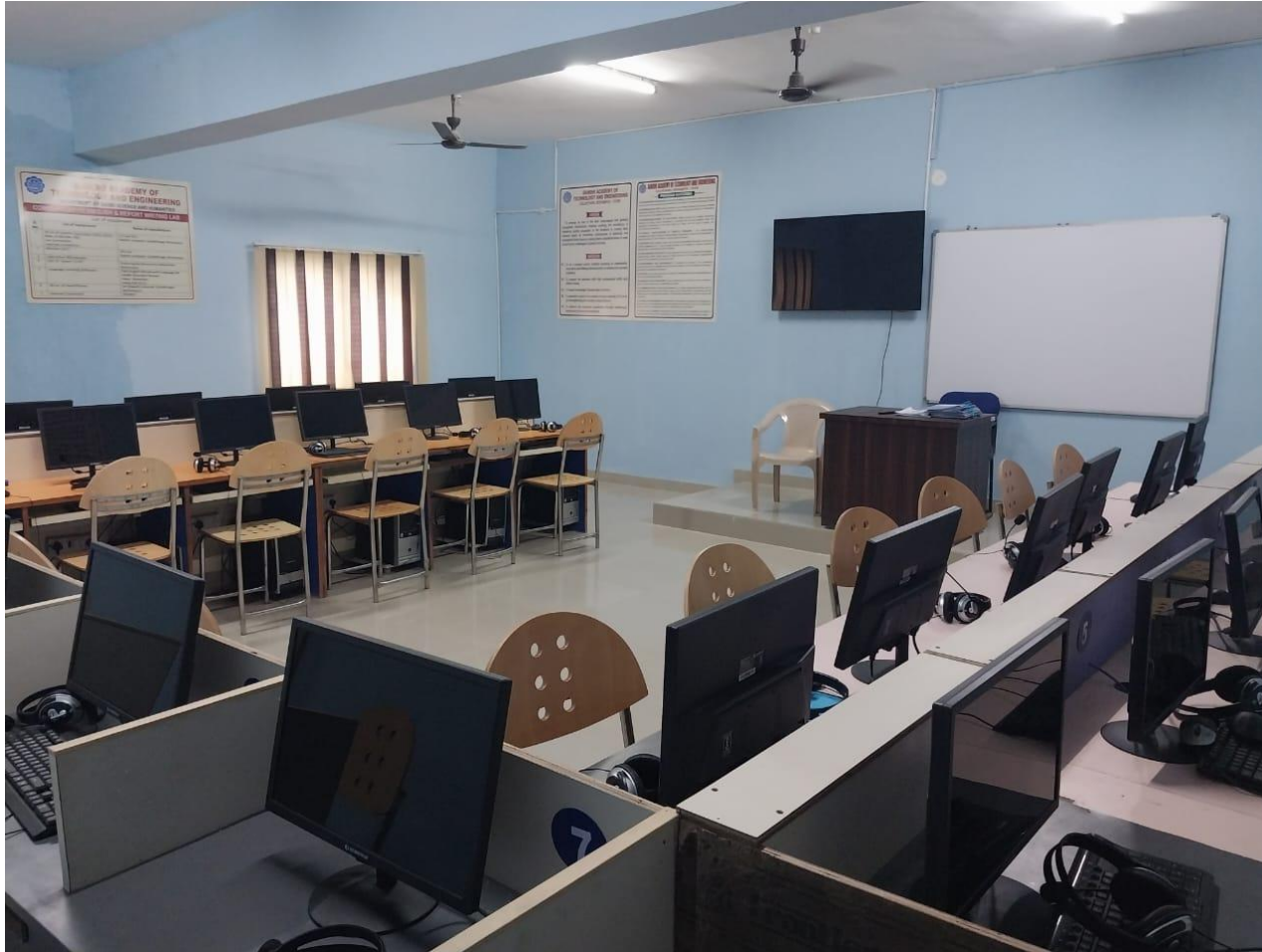
2.6 Language Lab (BSH)