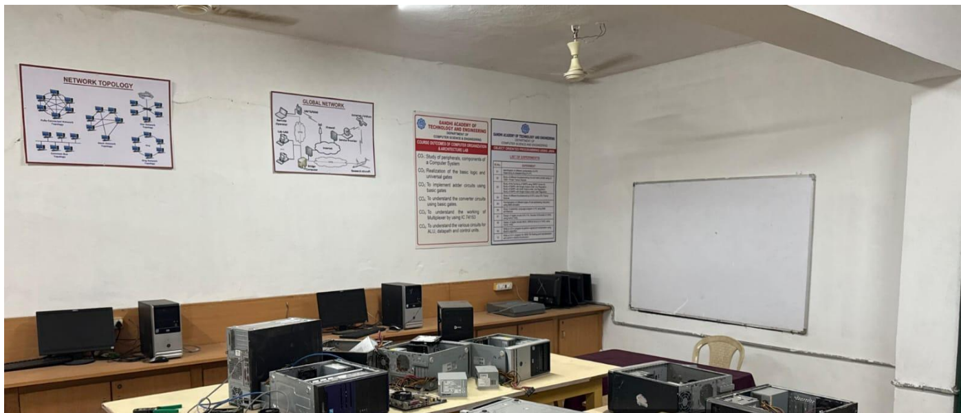
2.3 Computer Architecture and Computer Networks Lab (CSE/MCA)