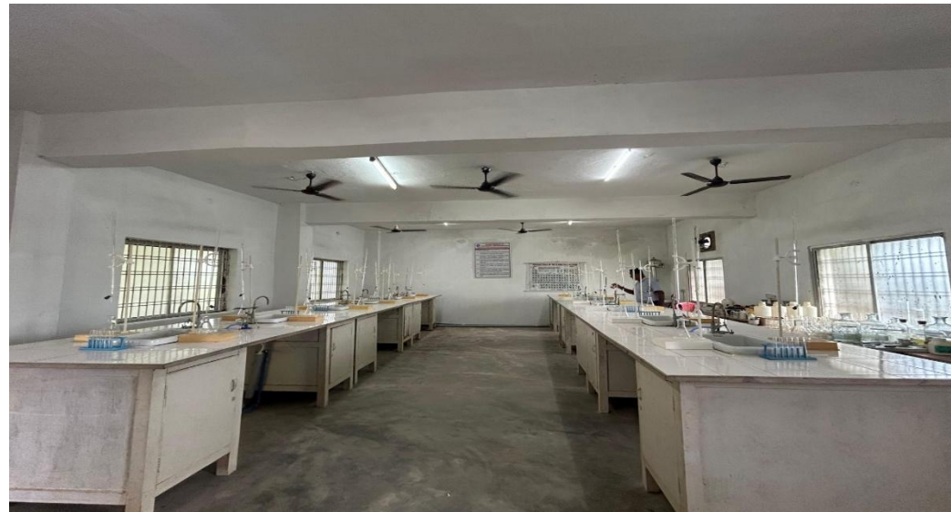
2.5 Chemistry Lab (BSH)