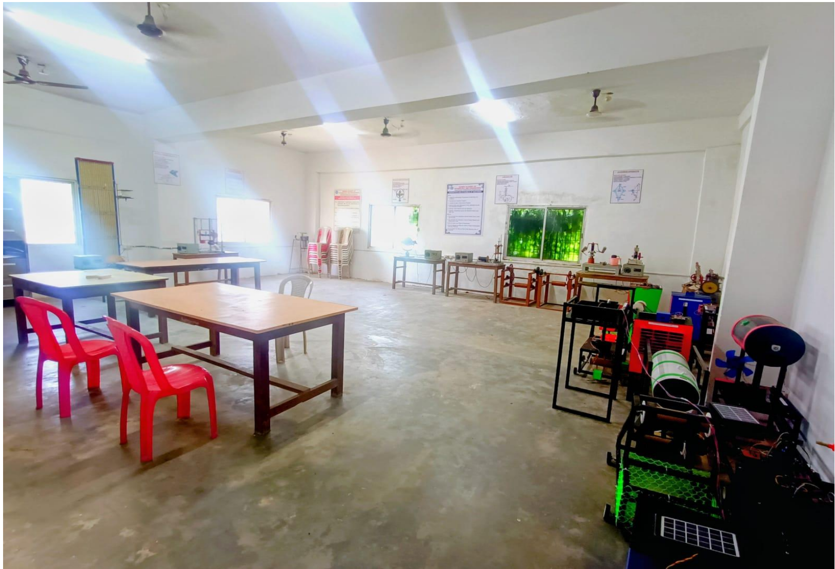
2.9 Mechanical Engineering Lab